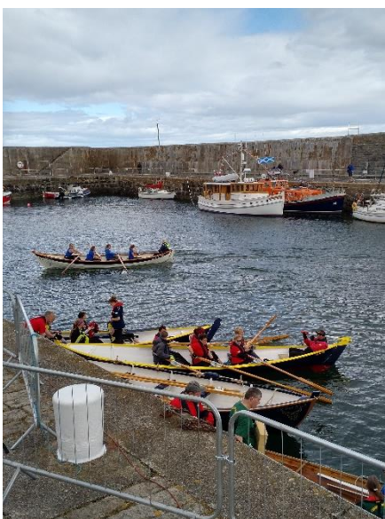
Orkney Rowing Club boats in the foreground with the Ewing McGruer in the background

We arrived at high water to find a melee around the slipway as numerous small boats took to the water. By the time the slip was clear there was insufficient water to launch Waterwitch which had been allocated a berth in the old harbour and was scheduled to sail in an event at 11.00 on Saturday. On close inspection the silt and sand on the slipway was found to be a real problem for the weight of our trailer. We also found that the allocated berth in the 'Old harbour' was very shallow and not suitable so a decision was made to display Waterwitch as a shore exhibit and not risk a launch at 01.00 with the owner having to spend the night aboard! Brian and Smith had arrived without incident and were berthed against a lifeboat set against the outer wall of the 'New' harbour.