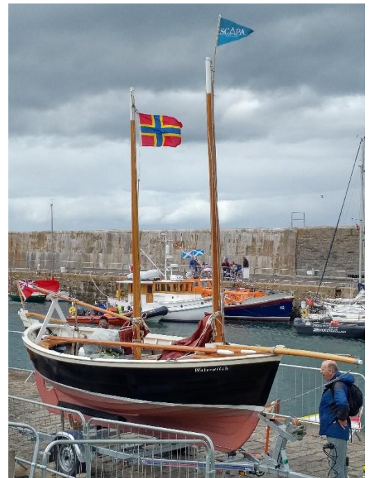
Waterwitch as a shore exhibit with the Ewing McGruer in the background